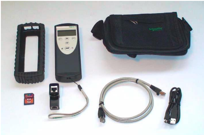
Multiloader kit – VW3A8121