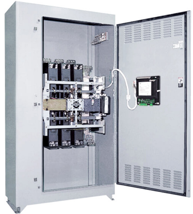
Figure 2: A three pole, 2000 Amp transfer switch in a ventilated Type 3R enclosure.

When transfer switches are deployed outdoors, exposure to sunlight and its associated heat gain are sometimes overlooked. For equipment with single-door construction, displays and controls can be degraded by ultraviolet radiation and other environmental elements. In addition, unprotected displays and controls that are accessible to passersby can present a security risk. Specifying locking "door-over-door" enclosures can limit environmental exposures and reduce risks of inadvertent contact, operation, and vandalism. Learn more in our white paper entitled Selecting Secure Enclosures to Protect Equipment from Ultraviolet Radiation .