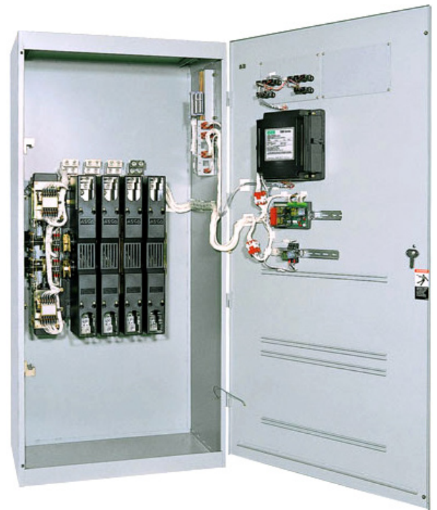
Figure 3: A four pole, 1000 Amp transfer switch in a Type 1 enclosure.