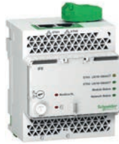
IFE Switchboard Server