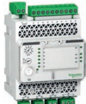
IO Application Module