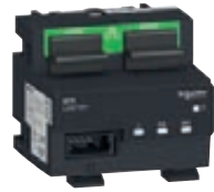
EIFE Embedded Ethernet Interface