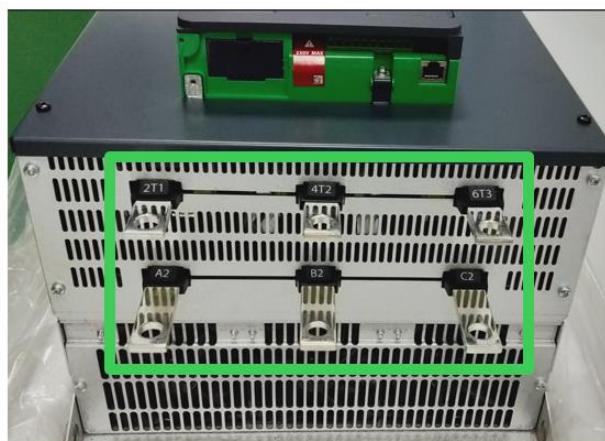
Correct representation (bottom view)